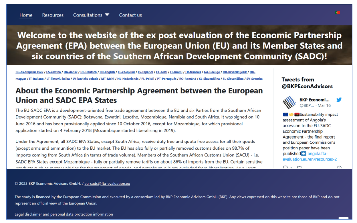
Figure 1: Screenshot of evaluation website

The use of meta data (keywords and strings of words) will ensure that the website is found easily on search engines in order to increase visitor counts and further impact. The website address will also be promoted among a large range of stakeholders and partners.